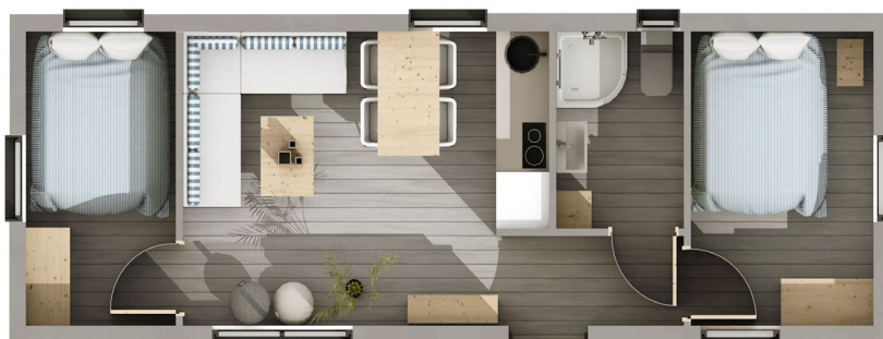
Sample interior layout * mirror layout or individual project available

The Meveline house of the REVA series is a solution for both individual clients as well as campsites, holiday centers and investors who profit from rental. It is a convenient alternative to houses built using the traditional method, wooden houses. The house is delivered to the site ready and usually placed practically on the ground, without foundations. Thanks to the removable wheels, it can be placed almost anywhere. After placing it on the target place, it is possible to effectively mask the mobility function and aesthetically blend in with the surroundings.