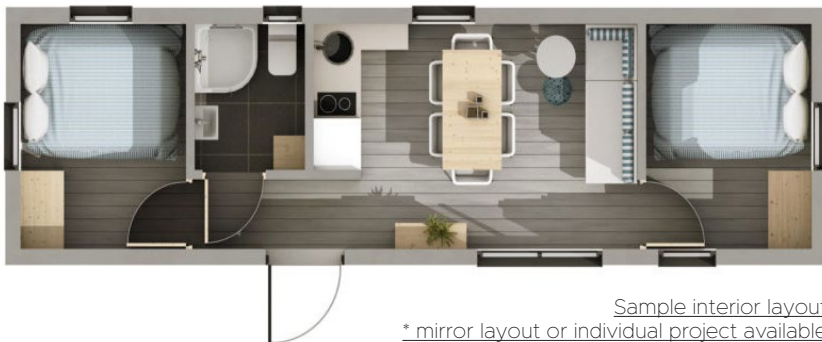
Sample interior layout * mirror layout or individual project available

The Meveline house of the REVA series is a solution for both individual clients as well as campsites, holiday centers and investors who profit from rental. It is a convenient alternative to houses built using the traditional method, wooden houses. The house is delivered to the site ready and usually placed practically on the ground, without foundations. Thanks to the removable wheels, it can be placed almost anywhere. After placing it on the target place, it is possible to effectively mask the mobility function and aesthetically blend in with the surroundings.