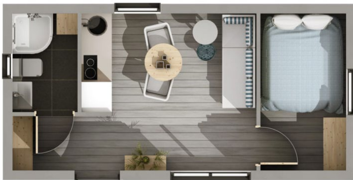
Sample interior layout * mirror layout or individual project available

The Meveline house of the REVA series is a solution for both individual clients as well as campsites, holiday centers and investors who profit from rental. It is a convenient alternative to houses built using the traditional method, wooden houses. The house is delivered to the site ready and usually placed practically on the ground, without foundations. Thanks to the removable wheels, it can be placed almost anywhere. After placing it on the target place, it is possible to effectively mask the mobility function and aesthetically blend in with the surroundings.