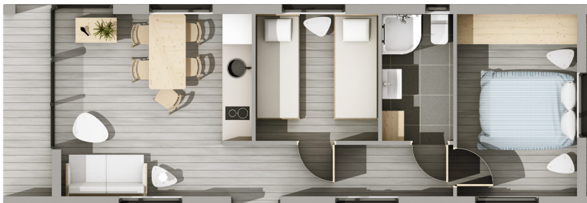
Sample interior layout

* mirror layout or individual project available