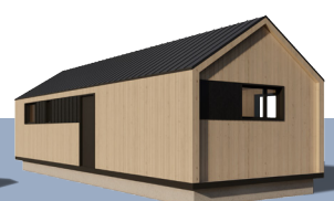
option - back

VELI houses are characterized by a modern architecture line, emphasized by the huge glazing of the gable wall and fashionable accents of finishing the facade.