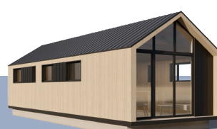
option - front