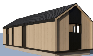
standard - back