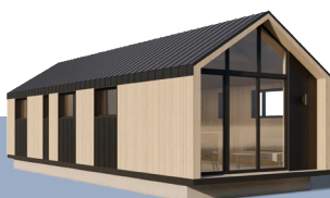
standard - front