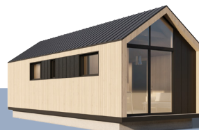
option - front