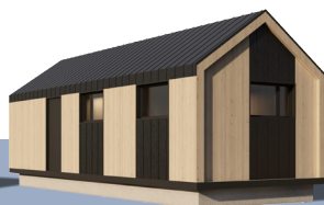
standard - back