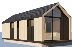
standard - front