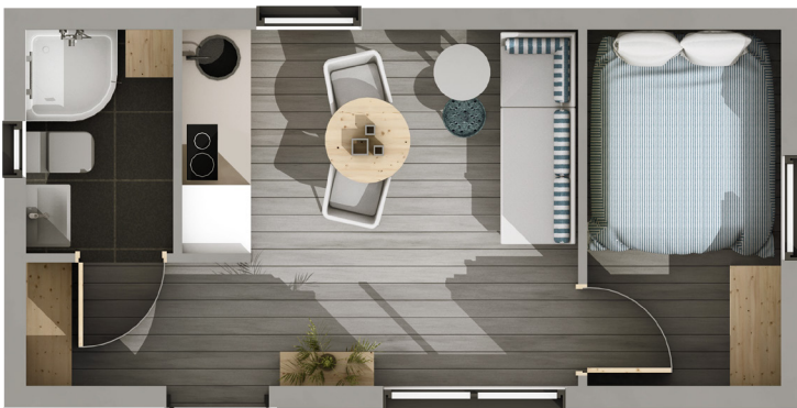
Sample interior layout

* mirror layout or individual project available