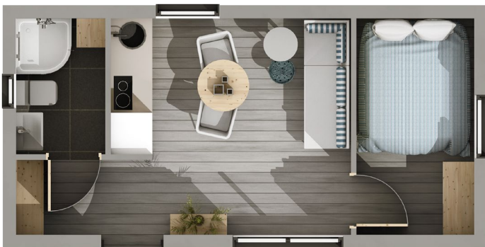
Sample interior layout * mirror layout or individual project available

Meveline homes are fantastic alternatives to wooden and traditional homes. The homes are delivered pre-built and placed directly on the ground without a foundation. Because of the attachable wheels, they can be positioned anywhere. The home's mobility has a huge impact on the use as a temporary structure. Additionally, after placing the home at its permanent location you can mask the mobility function and aesthetically integrate it into the environment.